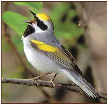
Golden Winged Warbler

Sponsors can choose how much they want to pledge