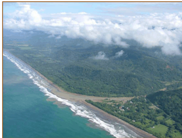
Hacienda Baru Wildlife Refuge

ing the donation of a strong conservation easement that was placed on the property by the landowner. In doing so, RBG has broadened the scope of our conservation efforts into land trust work in Costa Rica. As the holder of the easement, RBG has made the commit-