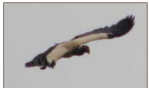
Picture of King Vulture taken during the count

For the complete bird list, follow this link .